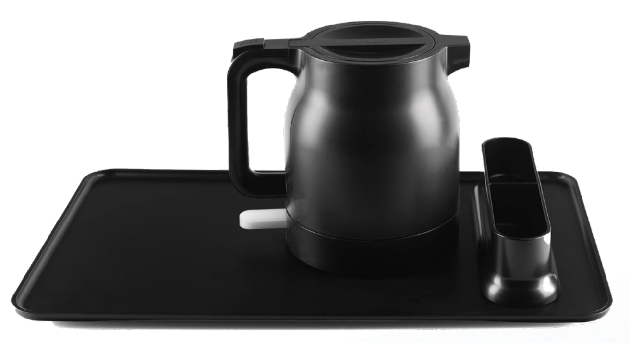
Black SP-100 (Kettle Sold Separately) Part Number: SP11 (12 per case)