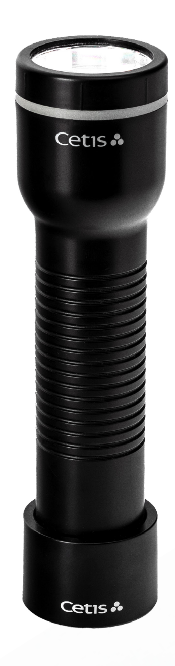
Black FL-102 Part Number: FL1021 (12 per case)