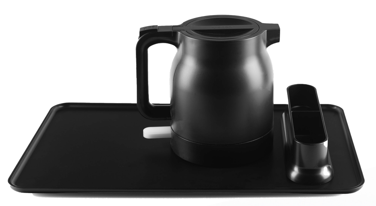
Black SP-100 (Kettle Sold Separately) Part Number: SP11 (12 per case)